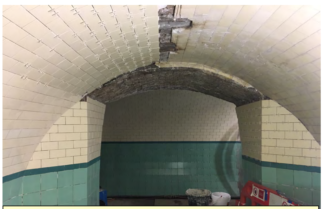
Once the tunnel leaks had been sealed new tiling has been laid. The tiles have been manufactured to match the existing tiles and are installed by heritage trained tilers.