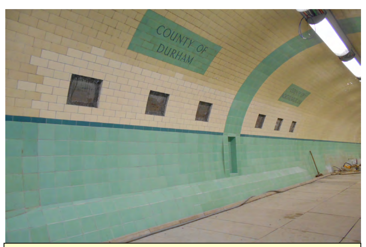
Following the installation of the new ventilation ducts the tiling has been replaced and only the duct covers remain to be installed.