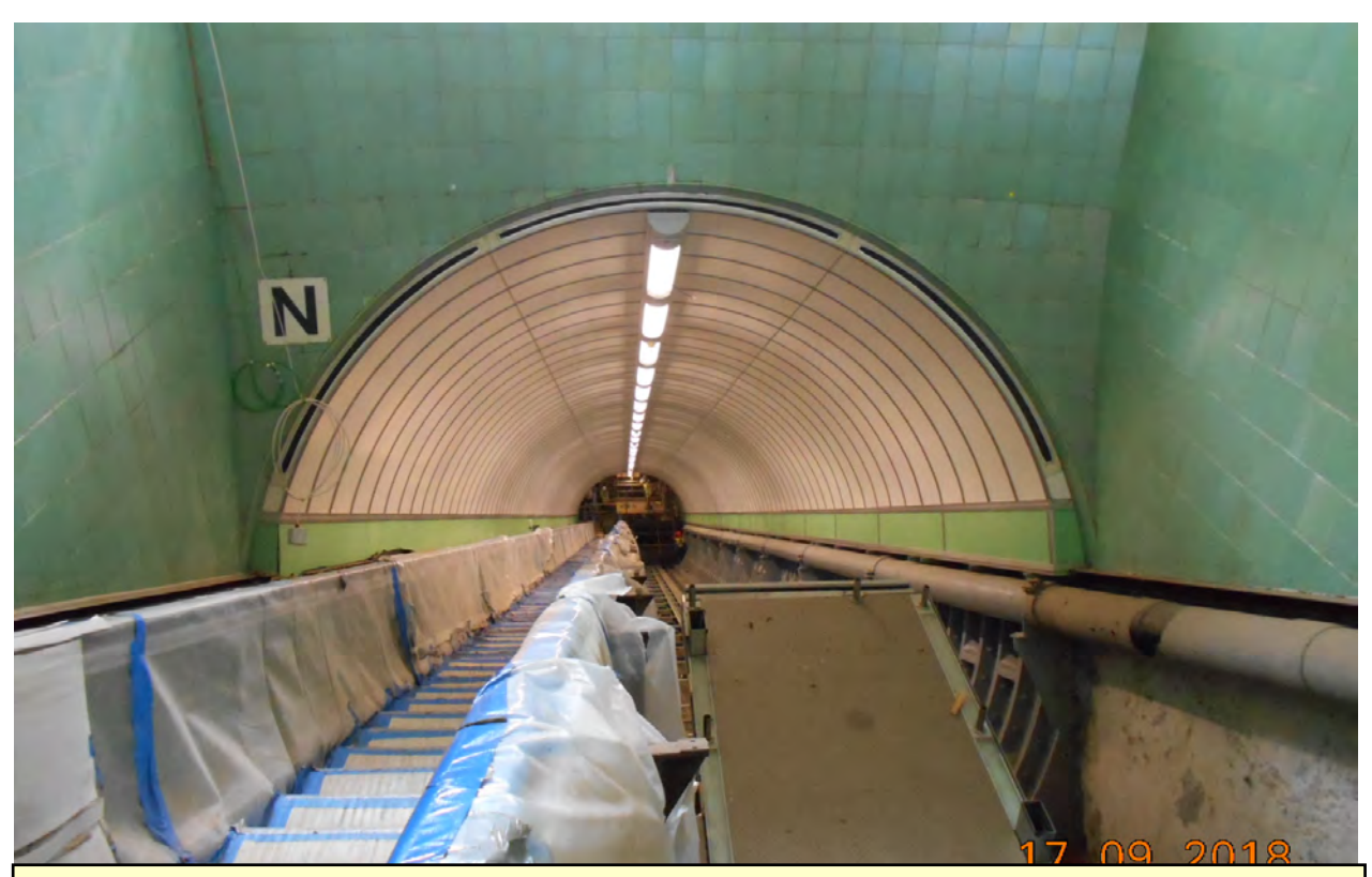
The scaffolding in the incline has now been removed to allow the inclined lift car to be completed. This will involve installing the glass walls and roof.