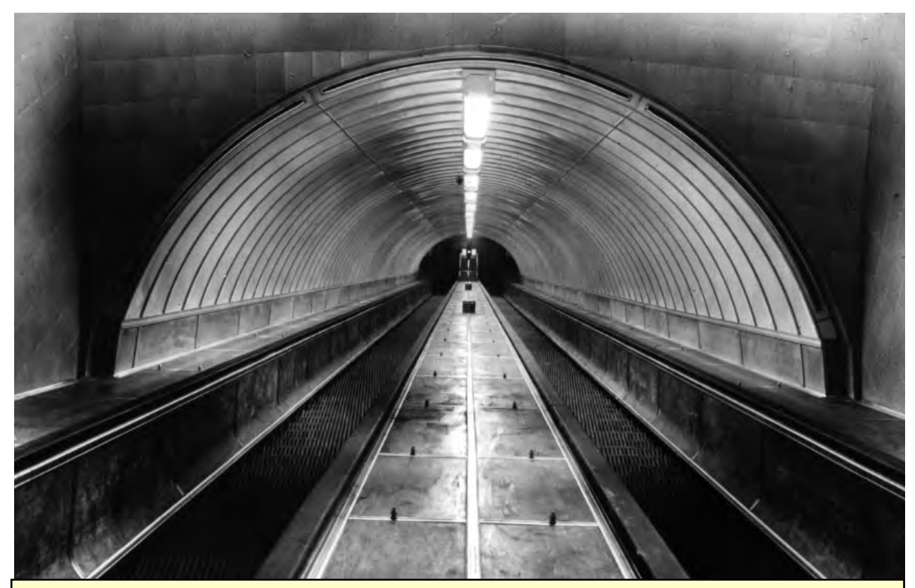
The refurbishment has seen one of the original escalators removed to make walk for the new inclined lift. But we have looked to retain the original character of the structure.