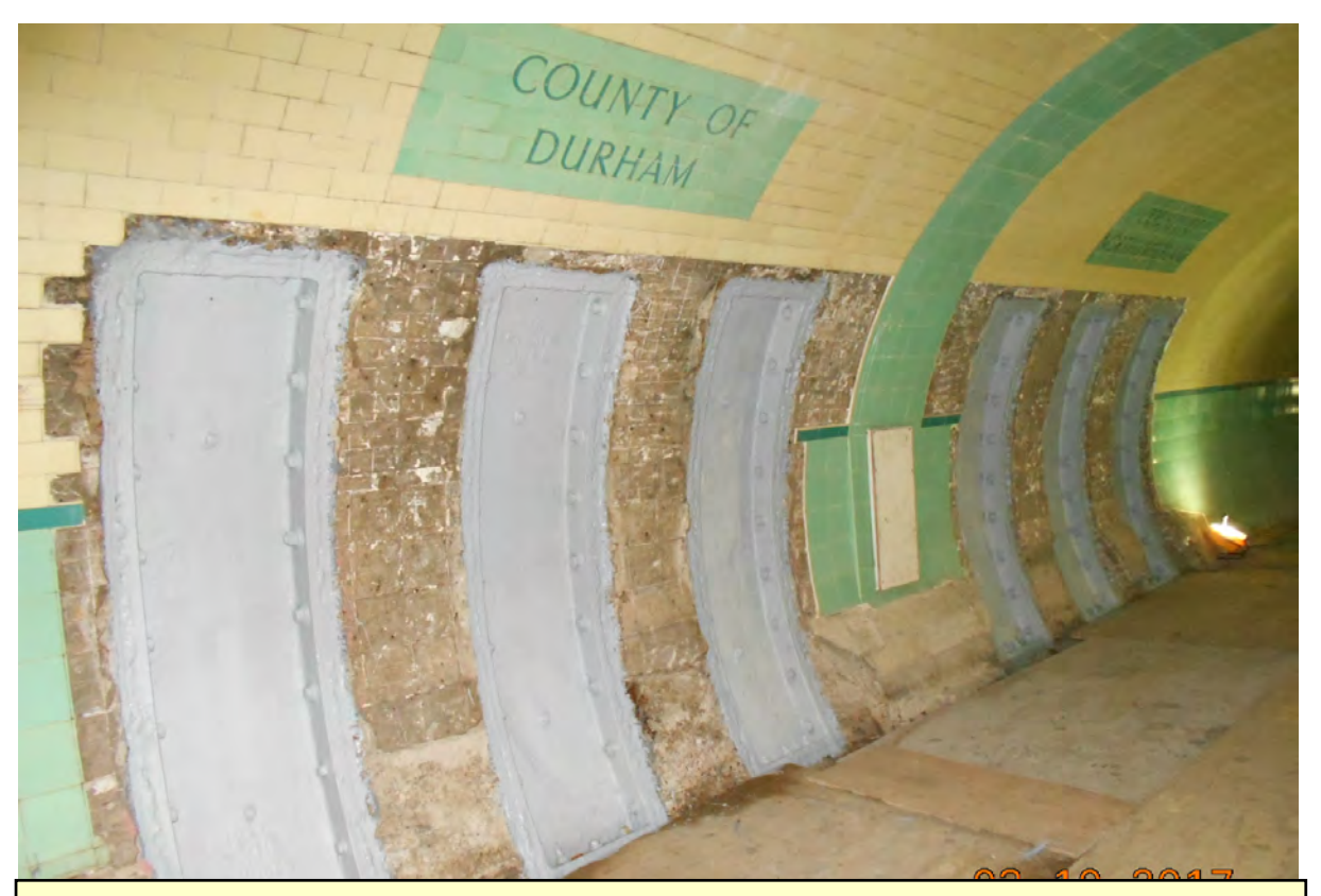
The ventilation ducts in the centre of the tunnel had to be completely replaced.