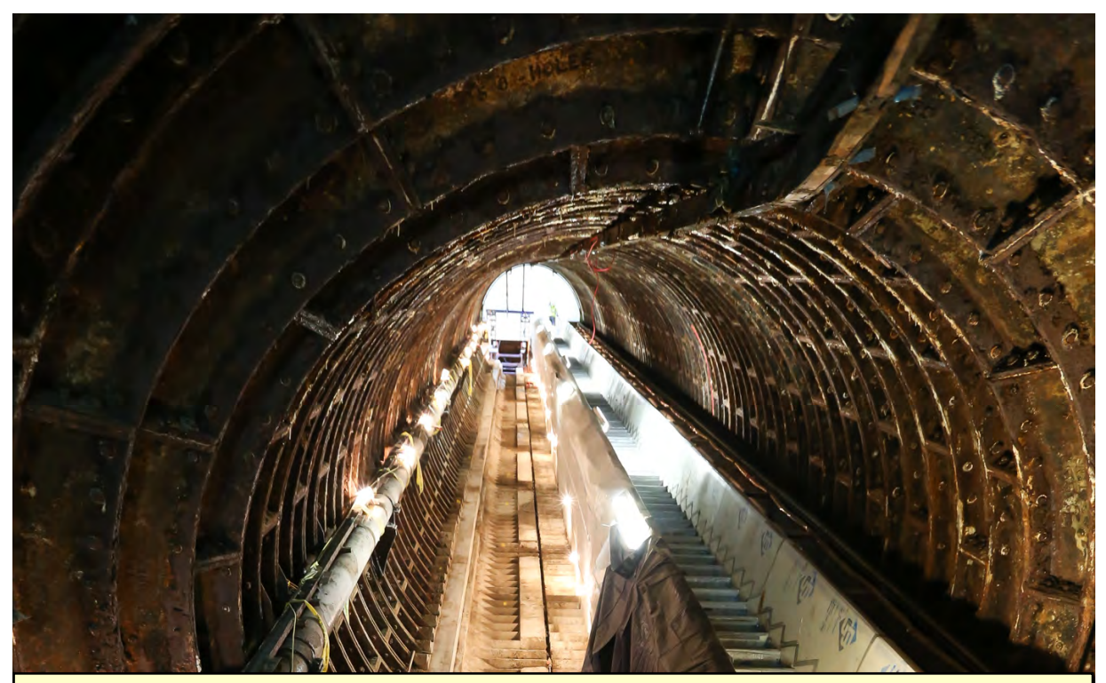
The refurbishment works required the removal of one escalator at each end of the tunnels and complete removal of the cladding system