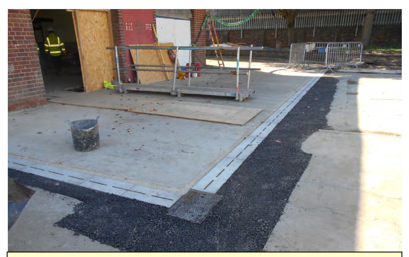
The concrete slab in from of the rotunda building has now been replaced as has the drainage. The next element of works externally is the replacement of the surfacing.