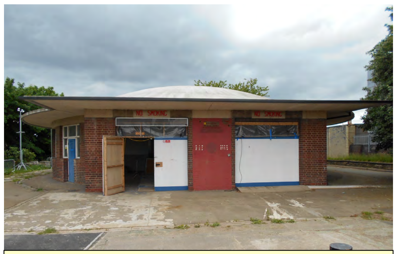
The external fabric of the rotunda buildings is being repaired and cleaned up. The concrete slab in front of the building has had to be fully replaced.