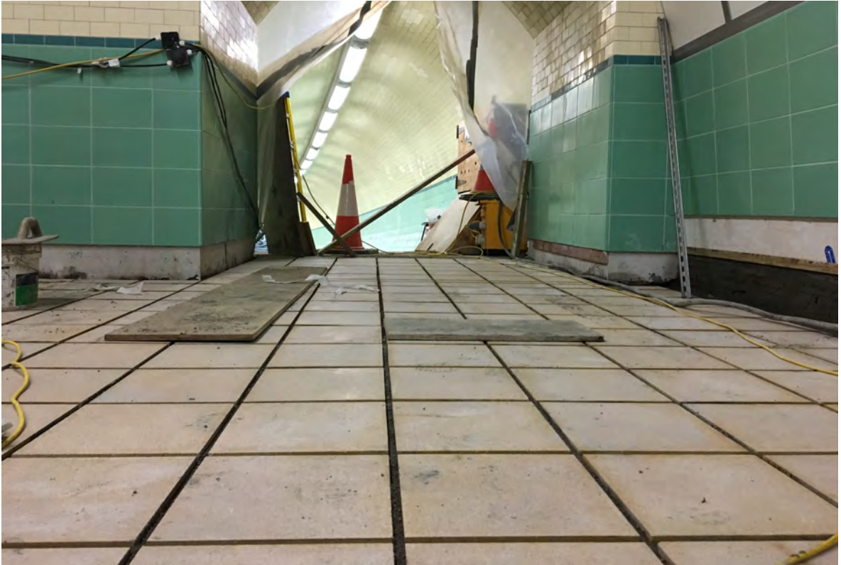
The terrazzo flooring to the lower halls is nearing completion. The grouting, edge 'skirt' and final wall tile are yet to be installed.