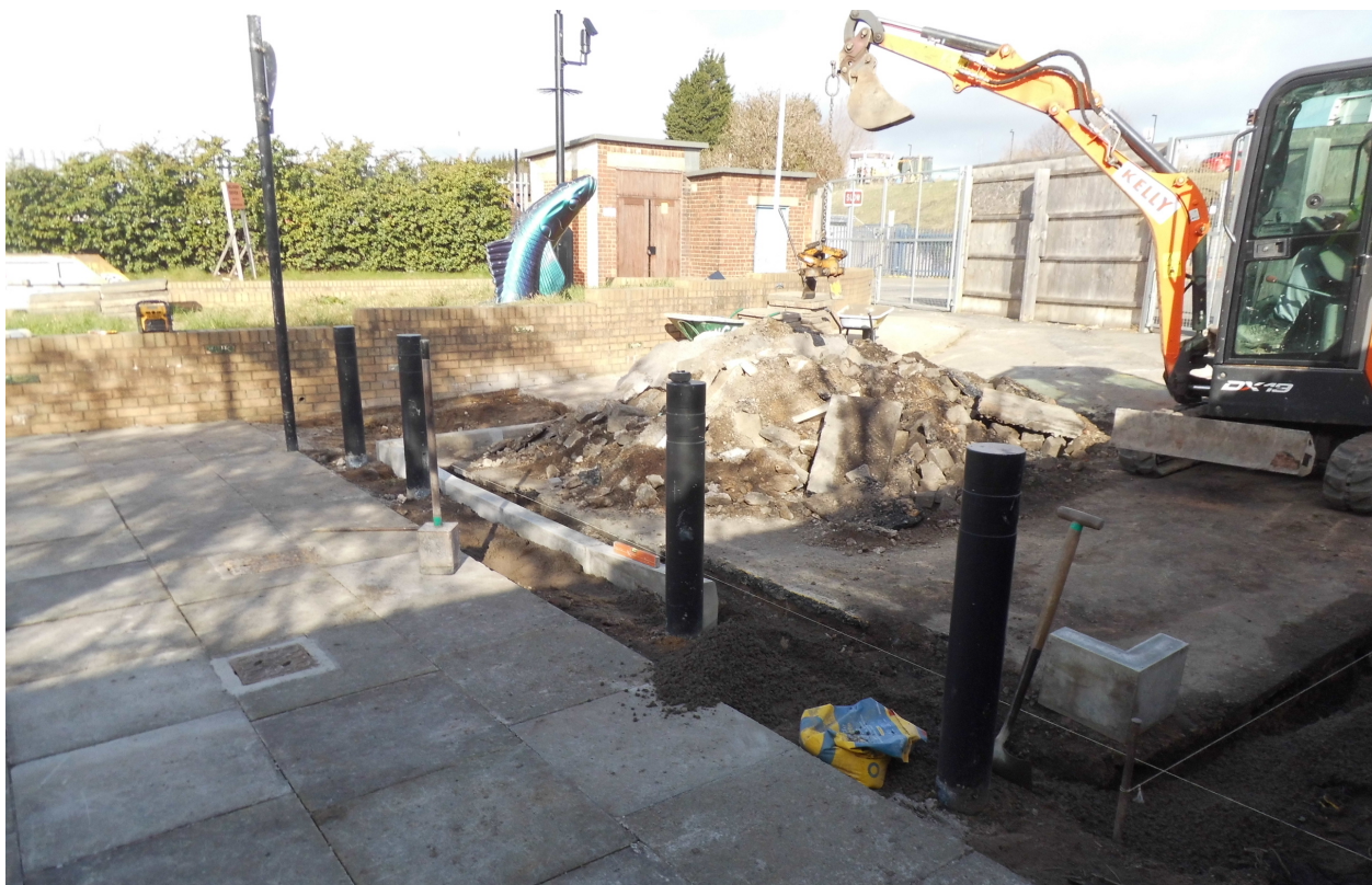
New bollards and drop kerbs have been install to control vehicle access and assist easy access for pedestrians.