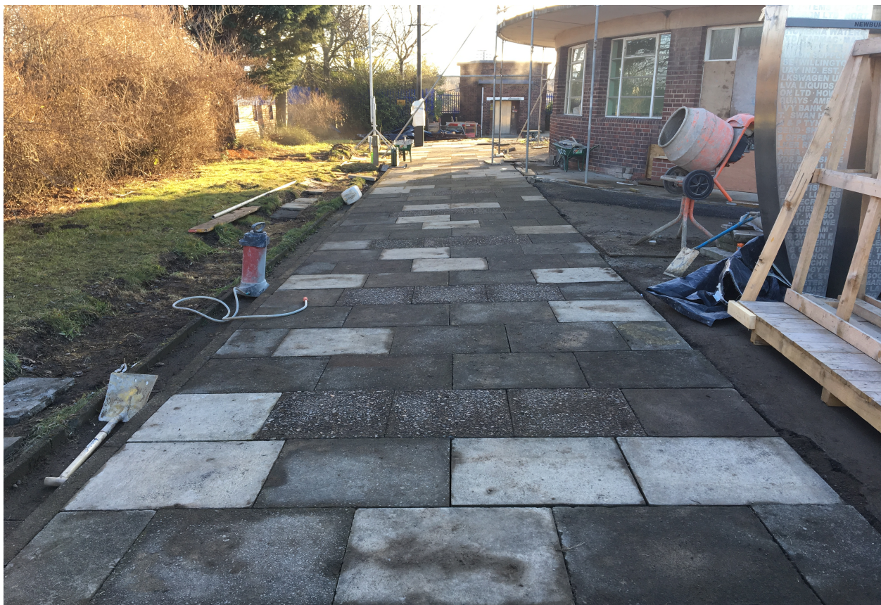
Externally the paving has been relaid providing pedestrian access to the vertical lift.